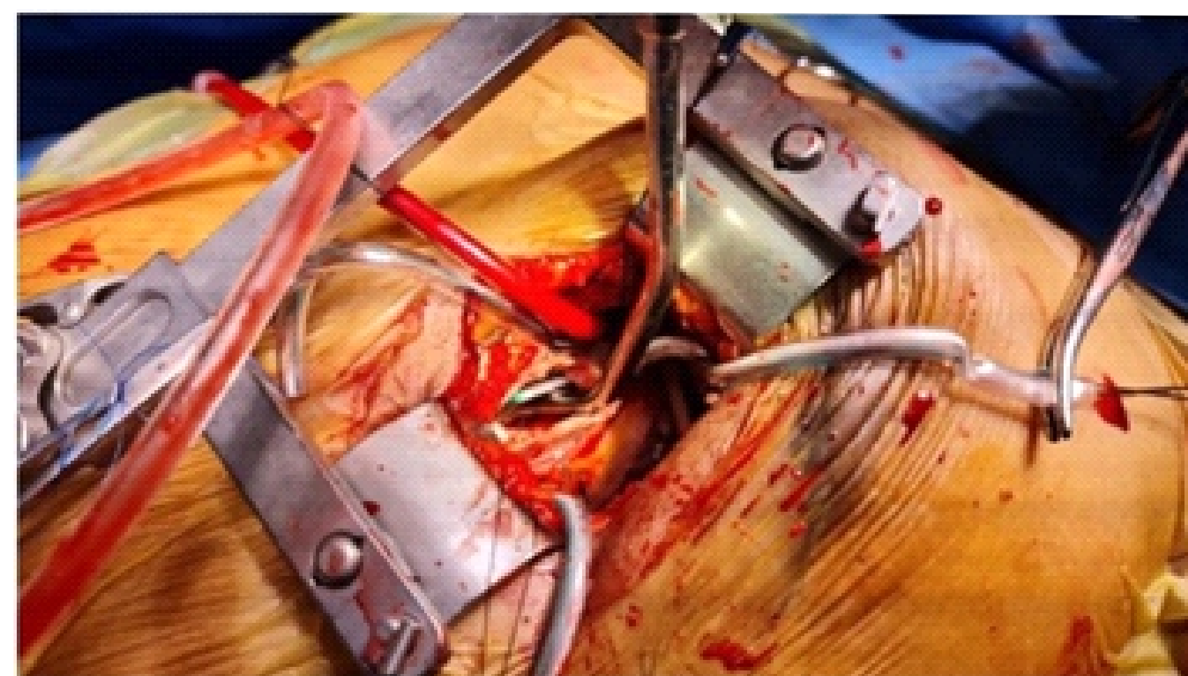
B. Intraoperative picture showing Atrial Septal Defect