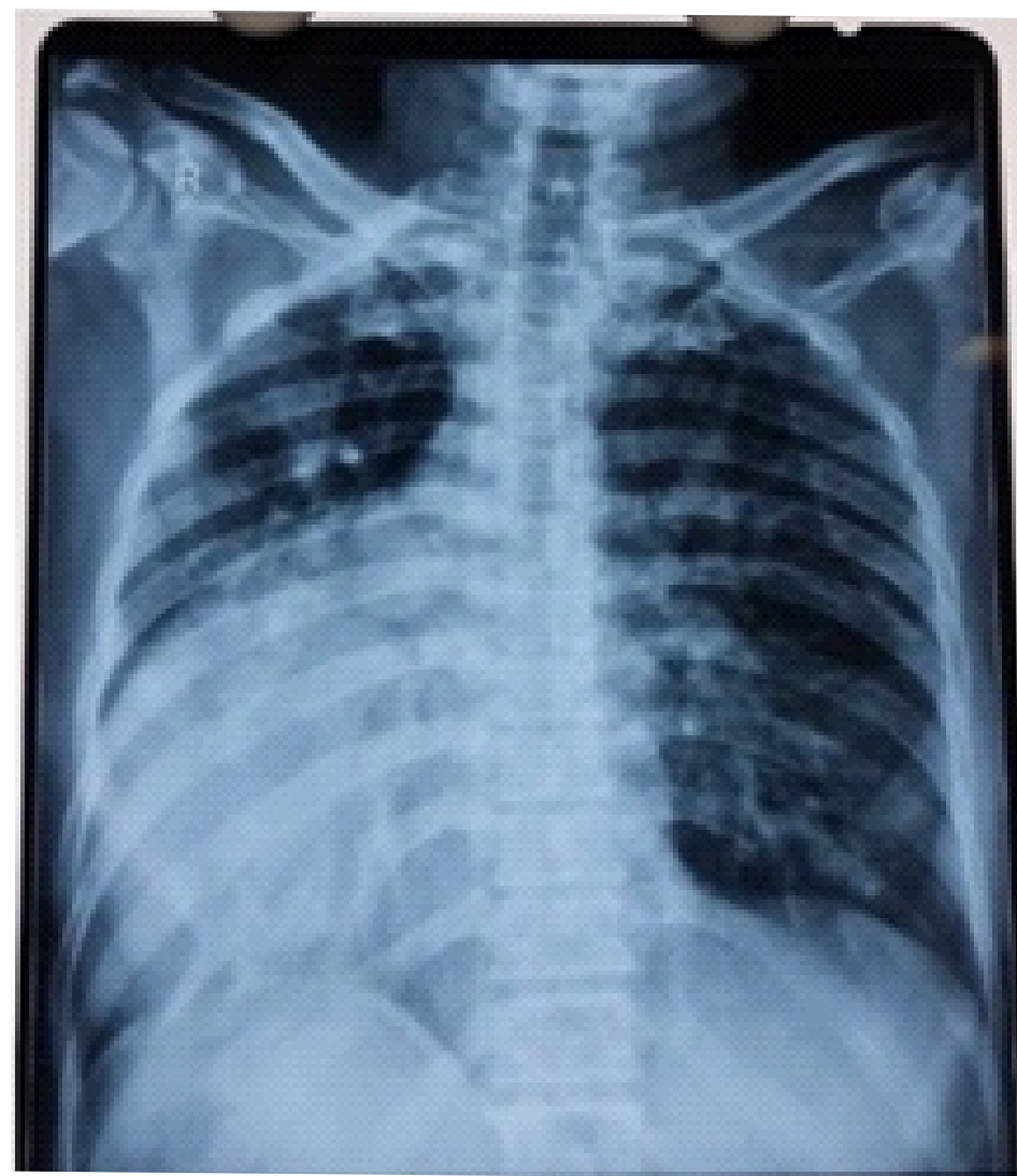
A. Preoperative Chest X-ray

A 44-year female patient presented to our hospital with a history of dyspnoea on exertion for 3 months (NYHA 2), and on transthoracic echocardiography showed Dextrocardia with 26 mm ostium secundum atrial septal defect with left to right shunt with deficient IVC rim, mild TR and normal biventricular function. Chest radiograph showing position of heart in right hemithorax with apex pointing towards right (figure 1A). Contrast-enhanced computed tomography (CECT) showed cardiac situs-dextrocardia and visceral situs-inversus with no systemic or pulmonary anomalies. The patient was intubated with a single-lumen endotracheal tube, A small 4 to 5-cm left anterolateral thoracotomy (LALT) was used to enter the thorax through 3rd intercostal space (ICS) which was corresponding to mid of right atria. An intercostal rib spreader was used for additional exposure and we did not perform rib transection/resection (figure 1B). Moderate, hypothermic Cardiopulmonary bypass (CPB) was established by percutaneous cannulation of the left common femoral artery and left common femoral vein (dual stage venous cannula; Medtronic, Bio- MedicusTM). Pericardial stays taken, which enhances the exposure of right atrium. The external aortic cross-clamp was inserted via the 2nd ICS at the left midaxillary line. Antegrade cardioplegia was delivered directly into the aortic root.